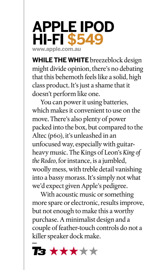
This Apple product has some core problems