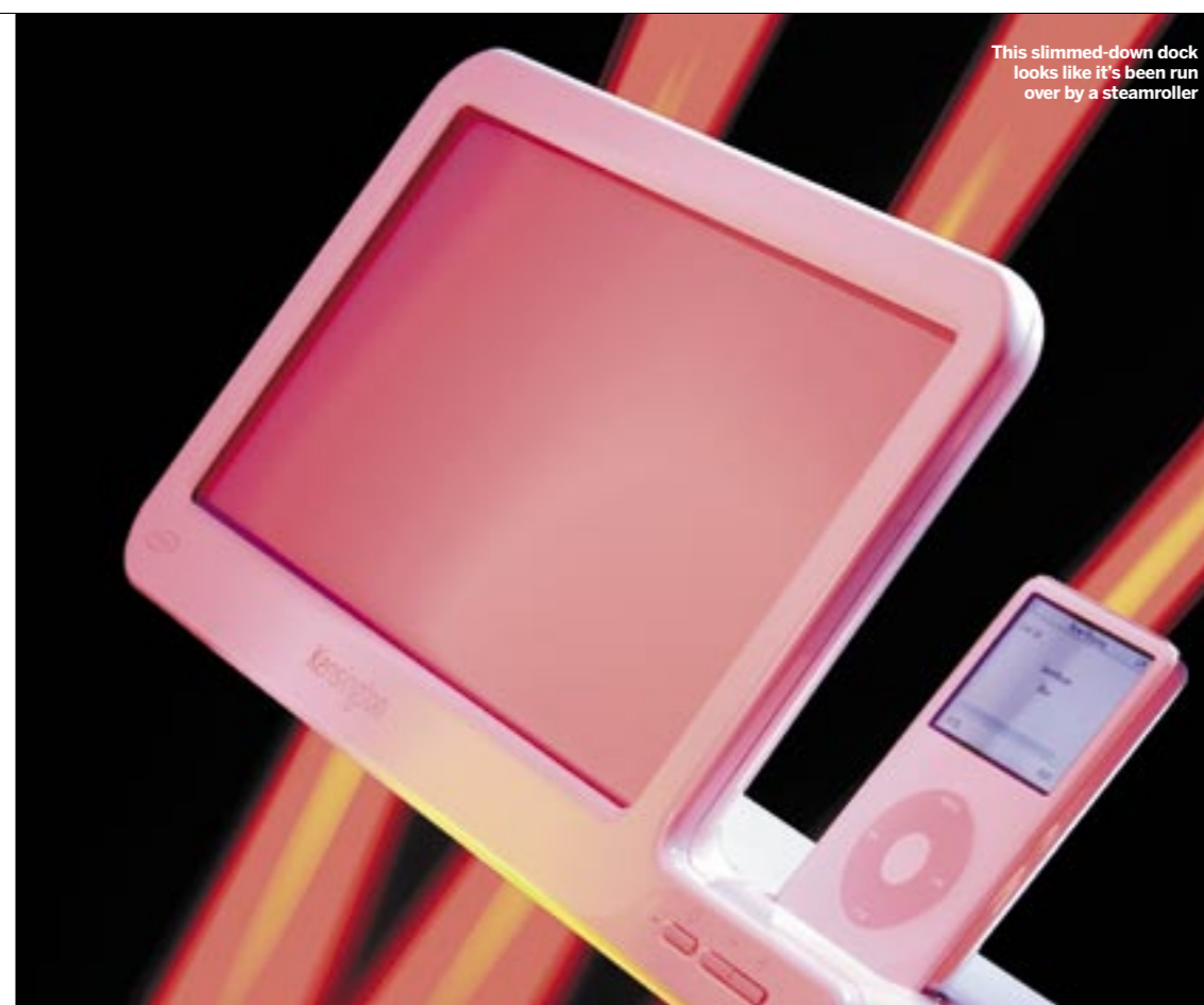
This slimmed-down dock looks like it's been run over by a steamroller